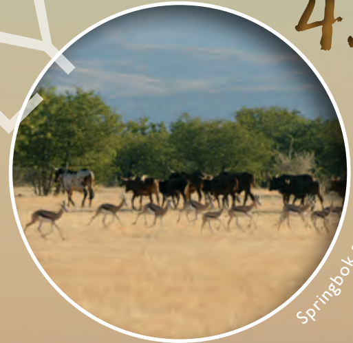
Springbok and cattle

... see wildlife, livestock and people living side by side