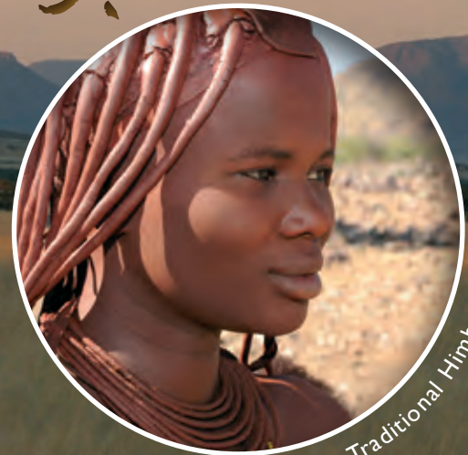
Traditional Himba culture

... spot 8 of Namibia's near-endemic birds